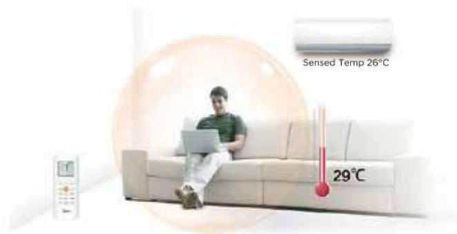
'Follow Me' inactive