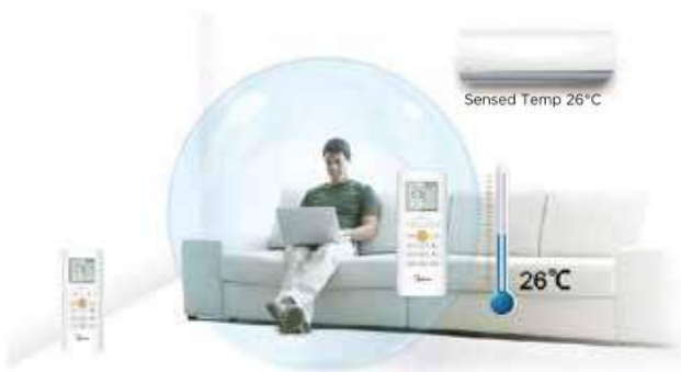
'Follow Me' active